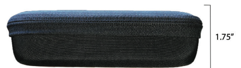
Side View (Remote)